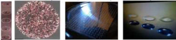
Lo 3D Printing !?

Increase Sensitivity for MALDI, SIMS & LDI by 10-100x Literally!